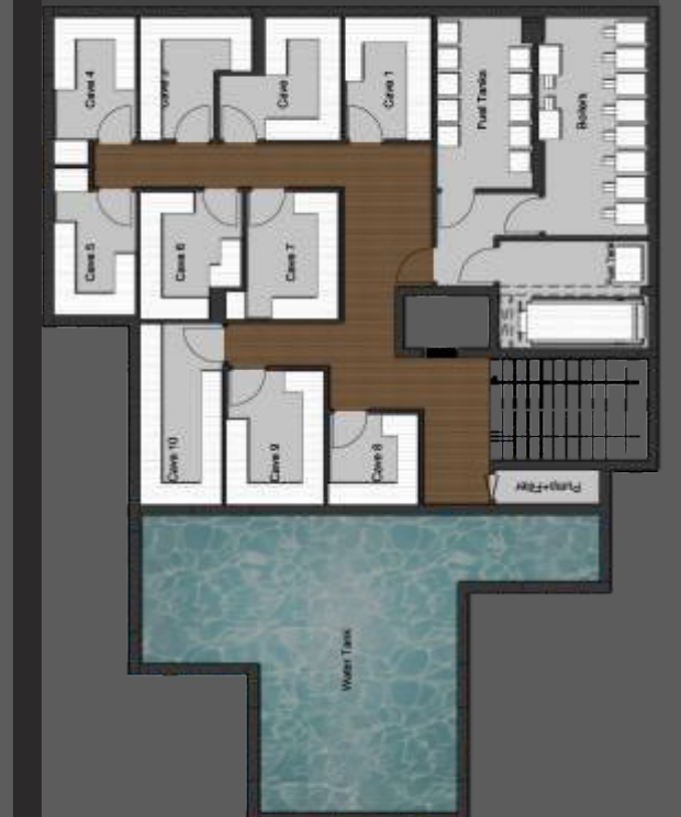
1st Basement Floor